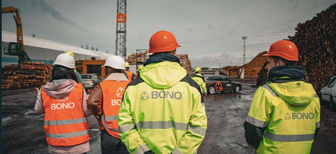
Table "Number of self-employed and temporary workers"

Each of our management team members leads their own team, oversees operational risks, and manages day-to-day activities to achieve the group's goals. Leadership positions are earned based on skills, professional experience, and alignment with the BONO Group's values and objectives. When a vacancy arises, preference is given to promoting existing employees whenever circumstances allow, supporting career development within the organisation. The gender ratio reflects the proportion of women and men at the management level (we have an equal number of female and male managers).