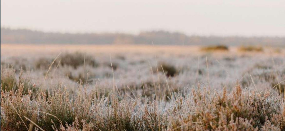
Table "Employee paid at or above minimum wage"

Additionally, a Whistleblowing Mechanism is in place to report any unethical behavior or violations confidentially. In the reporting period, no whistleblower reports were received, and no legal proceedings related to labour rights or employment practices were recorded.